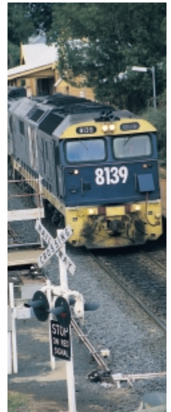
Rail services, Narromine.

A relaxed rural lifestyle, stable community with very little crime make the Narromine Shire a great place to live. Schools are located in the towns of Narromine and Trangie and both towns have hospitals, aged care hostel/nursing home, community health services and the support of an extensive regional professional medical network. The Shire boasts excellent sporting fields and active sports clubs, an indoor sporting centre and gymnasium, water sports, art and cultural groups, clubs and hotels, annual shows and special events and many parks and recreation areas. In fact the Shire has everything for the family.