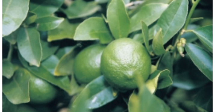
The largest commercial lime orchard in Australia,

The Narrromine Shire is ideally situated in the heart of the rich Macquarie Valley. Narrromine, on the banks of the Macquarie River, offers a quality rural lifestyle and yet is just 39 kms away from the regional city of Dubbo.