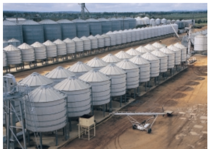
Large grain storage facility, Narromine.