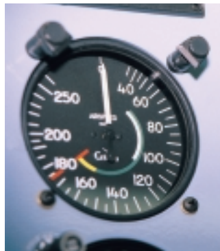
Radio and instrument repair service.

annual Easter FlyIn results in around two to three hundred visiting aircraft. A new Aviation Museum complex is under construction to display the history of flight in Narromine. Businesses located at the aerodrome include a radio and instrument repair service,